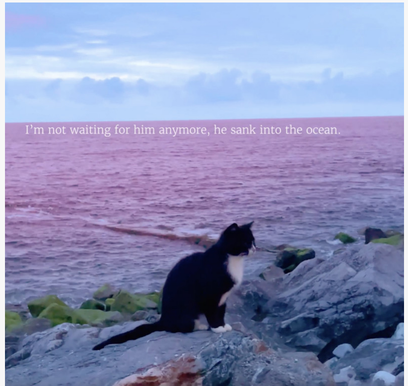
poster The Blind Swimmer