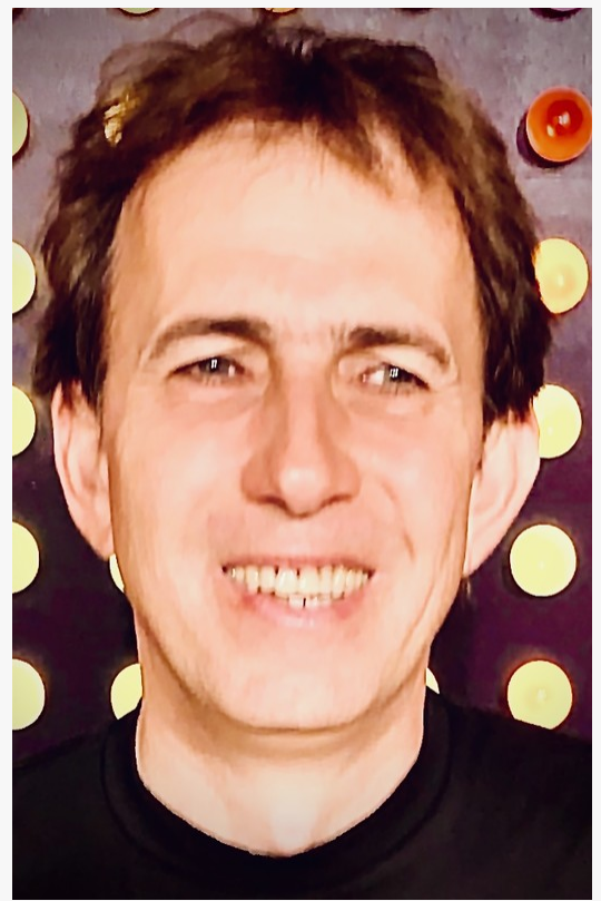
director The Blind Swimmer

This press release can be viewed online at: https://www.einpresswire.com/article/636183764