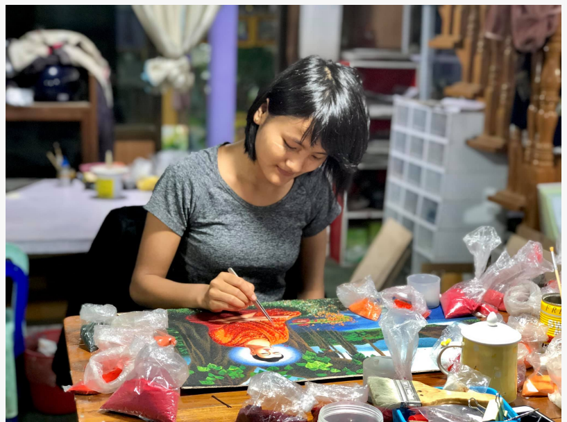
Artist Handcrafting Gemstone Painting