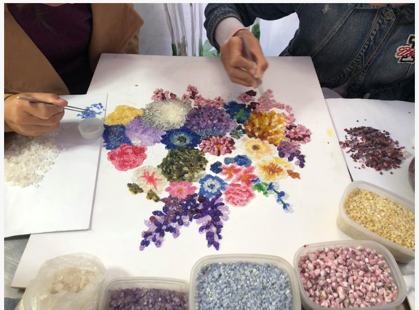
Artwork using rough gemstone found in the region of Mogok