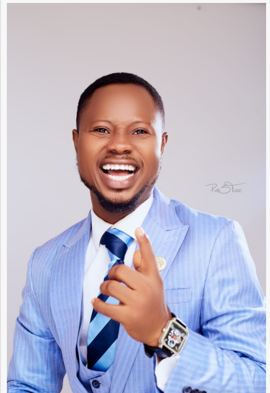
CEO at YPN, Leading International Publishing and Media, LLC