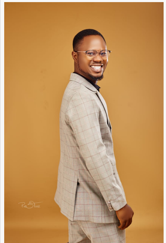
CEO, YPN Publishing and Media Group.

Beyond the creative realm, the discipline and dedication instilled by music have propelled this media mogul's rise to global prominence. The pursuit of mastery, relentless