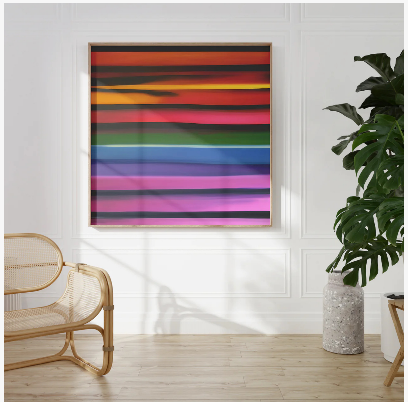
Stipa by INKIS framed