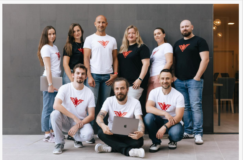
Moravio's Dedicated Software Developers

Choosing to engage with Moravio remote delivered TypeScript development services provides clients the option of a Moravio assembled full cycle scalable TypeScript development team. This enables each client company to maintain priority focus on its own workflow. It's a highly workable and cost effective solution for small scale businesses who don't have internal IT development staff, as well