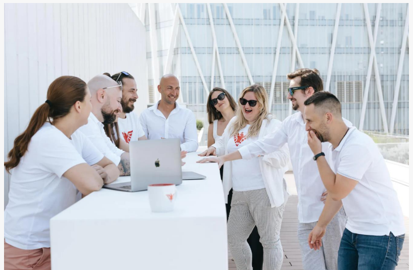
Moravio's TypeScript developers