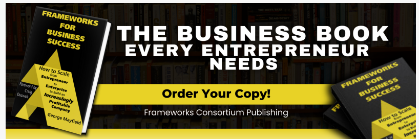
A banner for Frameworks for Business Success Book