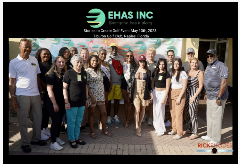
EHAS INC. Annual Charity Golf Tournament, Wows! Everyone While at Ritz Carlton Tiburon Golf Club

As we reflect on this momentous occasion, RICKRHODES INC., encourages everyone to rally