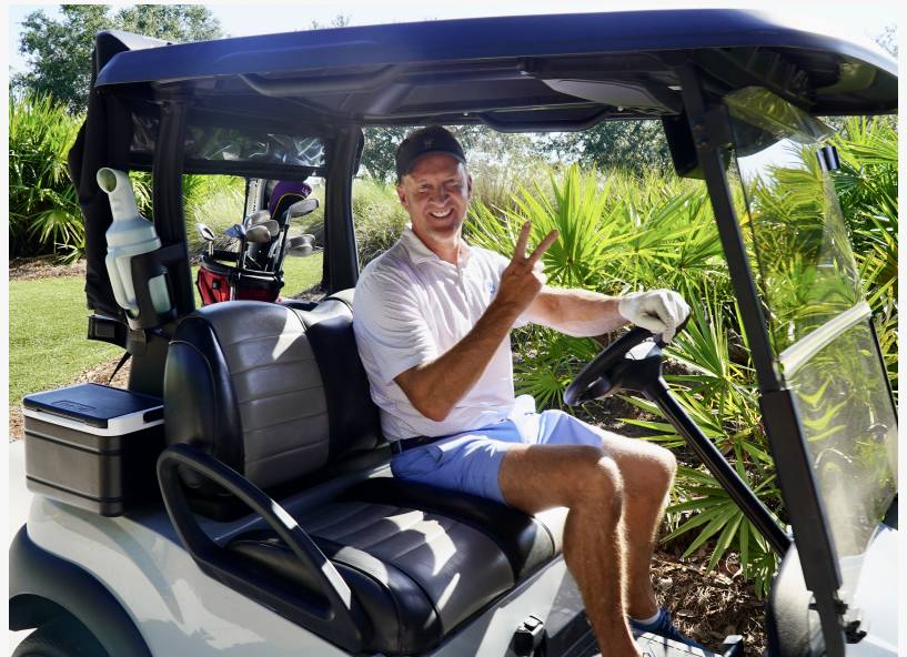
EHAS INC's Chance at a Million Dollar Shot! Brings Ear to Ear Smiles.