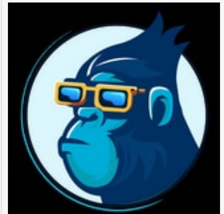
Animation Explainer Video Production

Recognizing the power of video as an engaging medium that inspires action, ByteChimp specializes in producing short online marketing videos that effectively explain and promote products and services. With a team of experienced writers, directors, producers, designers, and editors, many of whom have worked on successful YouTube commercials and national TV campaigns, ByteChimp has established a strong reputation for delivering exceptional results.