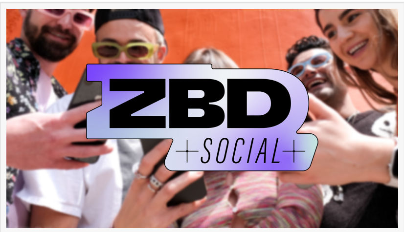
ZEBEDEE announces new social features in the ZBD app.

HOBOKEN, NJ, US, June 8, 2023 /EINPresswire.com/ -- ZEBEDEE, the game-changing Consumer FinTech player turning heads with its rewarded entertainment, Bitcoin Lightning-powered ecosystem, announced today that they're opening the doors to an early alpha of the biggest upgrade of the ZBD app yet: Social.