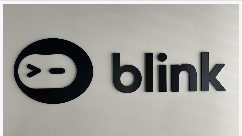
Photo from Blink Ops office in Tel Aviv, Israel.

The Most Powerful Security Automation Platform Ever Built