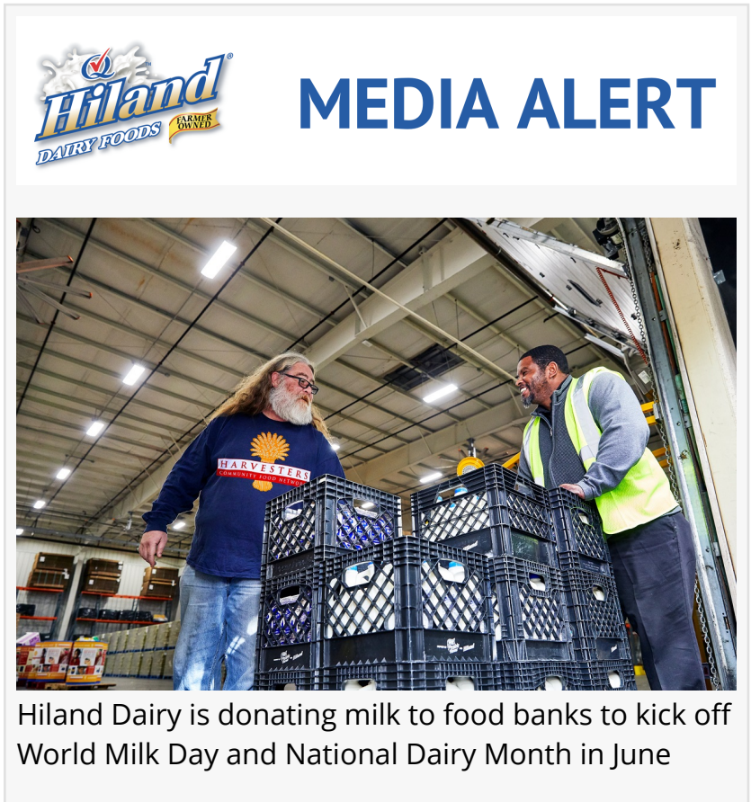
Hiland Dairy is donating milk to food banks to kick off World Milk Day and National Dairy Month in June