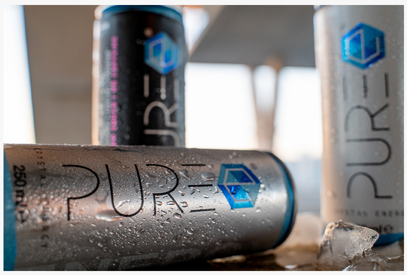
PURE Energy Drinks - all Products

All products will be available in the most common Online trading platforms, too.