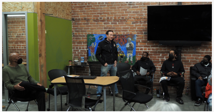
Beautify Richmond Project Launches First Group