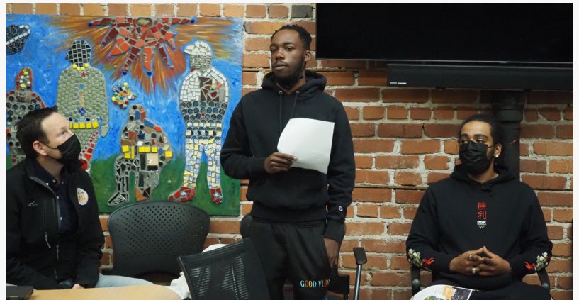
Justice Impacted Adults Selected for Beautify Richmond Project