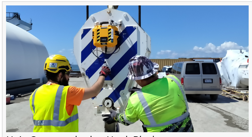
HoistCam attached to Hook Block

NORFOLK, VA, USA, June 1, 2023 /EINPresswire.com/ -- <u>HoistCam</u>™, a leading provider of high-performing crane and heavy equipment camera solutions, proudly observes the National Safety Council's National Safety Month. As an unparalleled operator's aid, HoistCam enhances