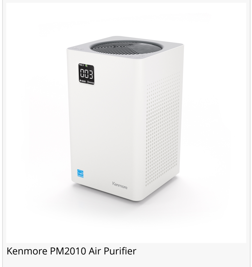
Kenmore PM2010 Air Purifier