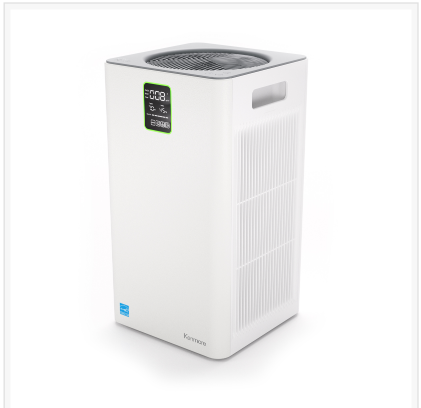
Kenmore PM3020 Air Purifier