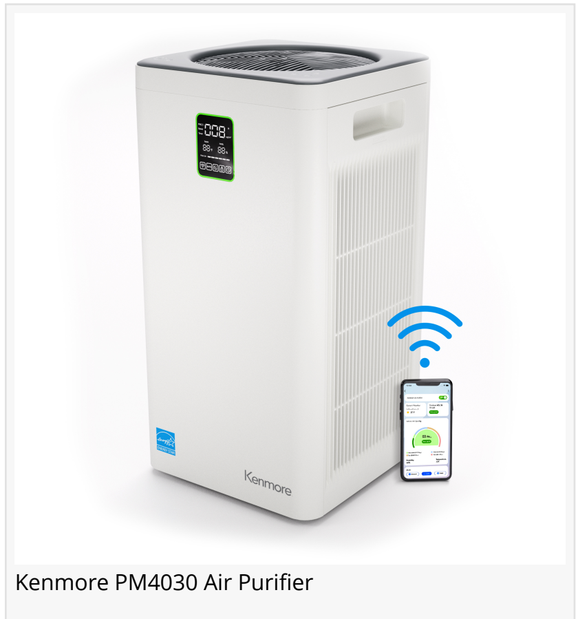
Kenmore PM4030 Air Purifier