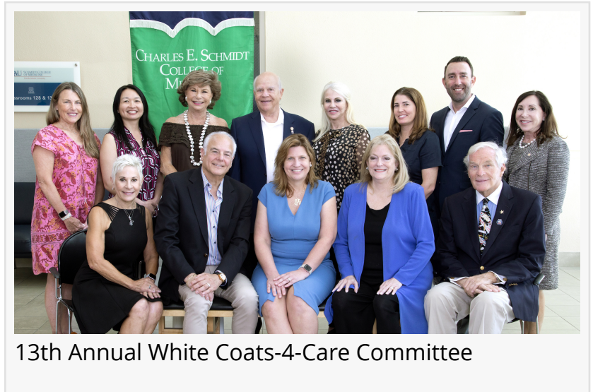
13th Annual White Coats-4-Care Committee

Drawing civic and business leaders, healthcare professionals and community advocates each year to welcome and “dress and equip” the incoming class of medical students, the event will be held at 6:00 p.m. on FAU’s Boca Raton campus. Annual WC4C campaign funds help CoM attract, recruit, train and educate the next generation of humanistic clinicians and scientists – doctors who care and cure in this community.