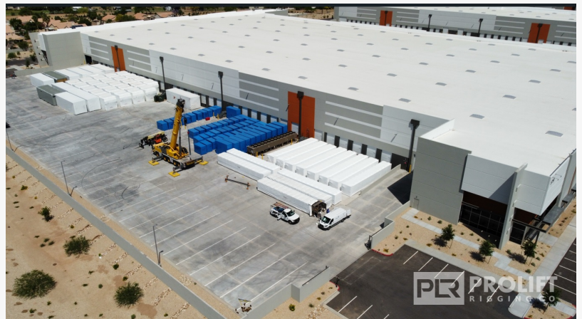
Arial view of the new ProLift storage facility in Glendale, AZ