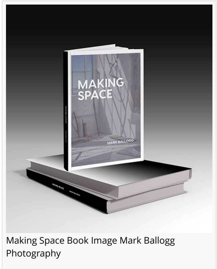
Making Space Book Image

The book represents 119 Chicago artists with 94 studio photographs intermingled with 80 artists' quotes. Wide angle, midrange, and closeup views are the basic template for an interpretive approach illustrating an extraordinary diversity of spaces. The conversations touched on all things Art, from the individual artists' relationship with their studio and how that studio models their practice outward to such questions as what art is, why make art, and art's personal and