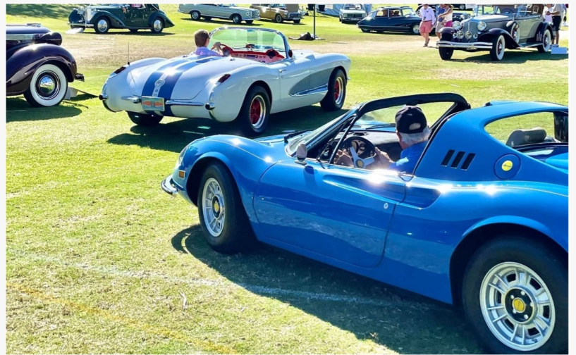
Delray Concours Cars