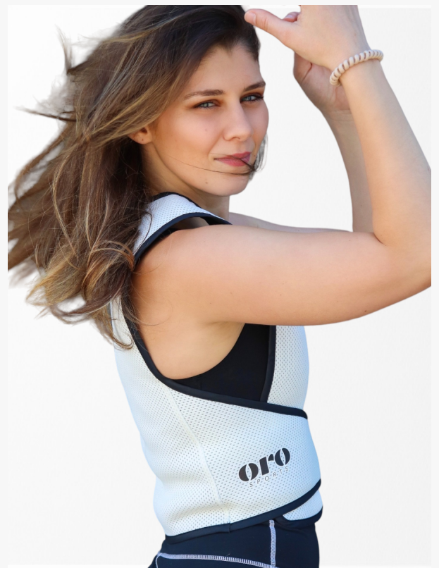
Maximo Cool Vest