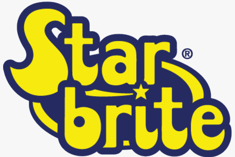
Star brite Corporate Logo