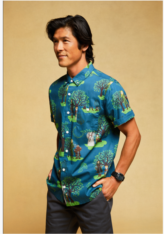
LORD OF THE RINGS WOVEN SHIRT FROM BOXLUNCH