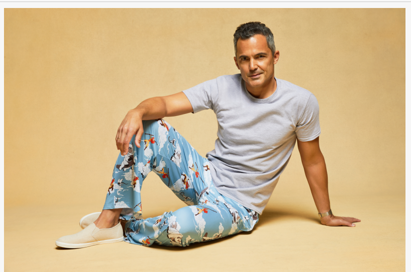
BOXLUNCH FATHERS DAY SELECTION

LOS ANGELES, CA, UNITED STATES, June 1, 2023 /EINPresswire.com/ -- This June, celebrate all types of father figures with a fun new Father's Day selection from pop culture retailer BoxLunch. Whether it's warming up with a coffee from a superhero-themed coffee maker or switching up their style with dad-themed apparel from dad's favorite tv show or movie, there are products for every dad.