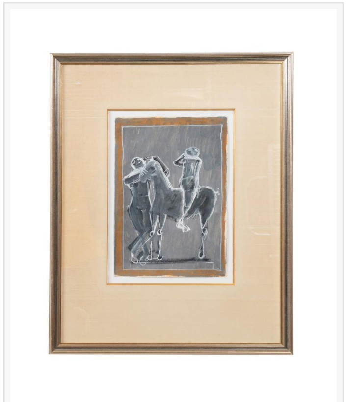
Mixed media and tempera on wove paper by Marino Marini (Italian/Swiss, 1901-1980), titled Cavallo e Cavaliere, depicting two figures and a horse, pencil signed (est. $20,000-$30,000).

Also offered will be a color lithograph on paper by David Hockney (English, b. 1937), titled Bora Bora, depicting a colorful tropical scene, pencil signed, dated and numbered ("74/100") lower left, in a 34 \frac{1}{4} inch by 48 inch frame (est. $10,000-$15,000); and a platinum and diamond engagement/wedding set with a solitaire brilliant cut diamond weighing 1.25 carats, of G-color