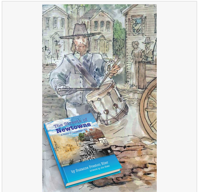
Illustration from The Streets of Newtowne

Unearthing Newtowne's history is like piecing together a complex puzzle. From its origins as North America's first planned city to its contemporary role as a thriving cultural hub, this town has witnessed a multitude of fascinating