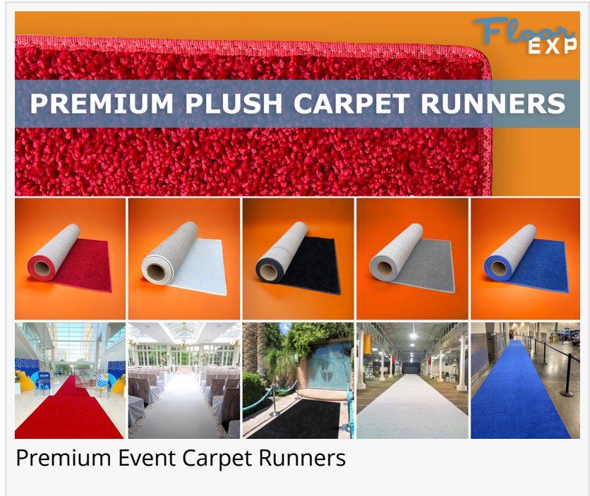
Premium Event Carpet Runners

SANTA FE SPRINGS, CALIFORNIA, UNITED STATES, June 1, 2023 /EINPresswire.com/ -- FloorEXP, the leader in the event flooring and custom event turf market has unveiled a new selection of flooring products designed to meet the needs of event planners, event designers, brands, venues and more. These new specialty flooring products include Contempo Rolled Vinyl, Contempo Lux Rolled Vinyl , EventFlex Rolled Vinyl, Pebble Beach Turf Rolls , ChoiceTurf Rolls, and Plush Event Carpet Runners.