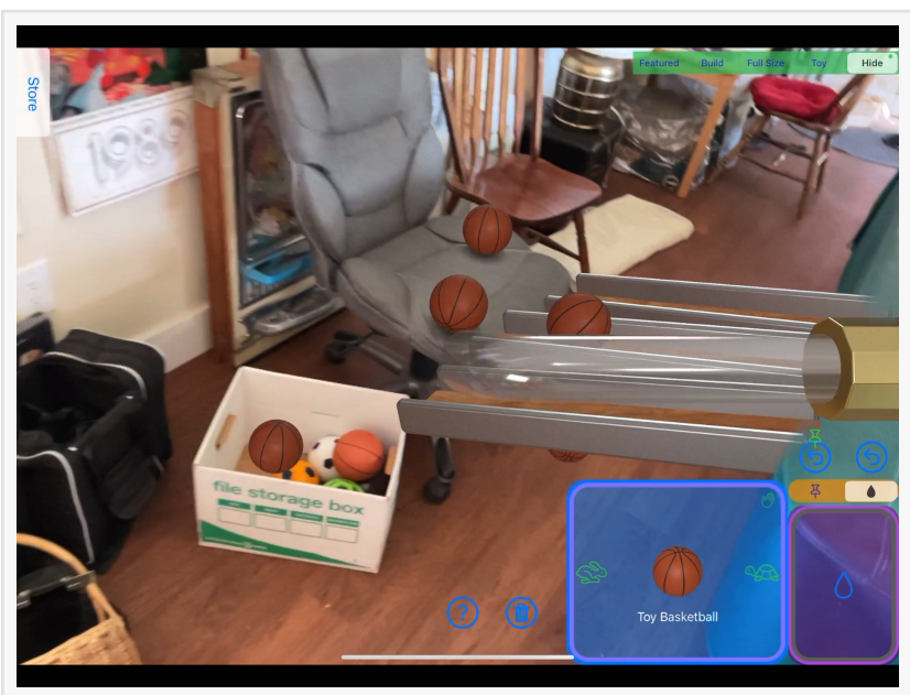
Seamless Virtual Balls Cross Real Furniture

SANTA CLARA, CALIFORNIA, USA, June 2, 2023 /EINPresswire.com/ -- Today at the Augmented World Expo 2023 conference, <u>Pantomime Corporation</u> presented an easy new Reality Construction Kit, the most advanced physical simulation app for iPhone Pro and iPad Pro devices — available free <u>at the App Store</u> today.