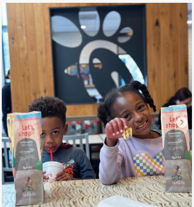
Upbounders® Logo on Chick-fil-A Kid's Meal Bag with Smiling Girl and Boy