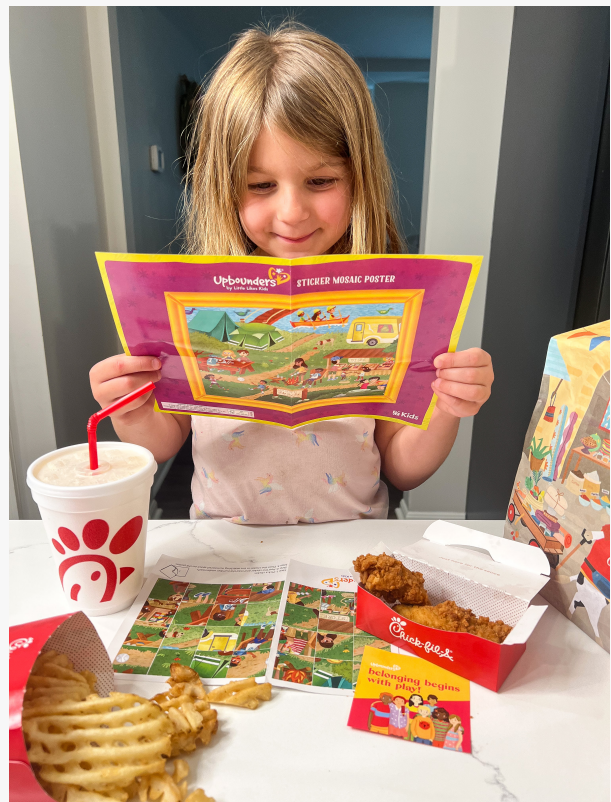
Girl Enjoying Upbounders® Camping Outdoors Sticker Puzzle Chick-fil-A Kid's Meal Prize