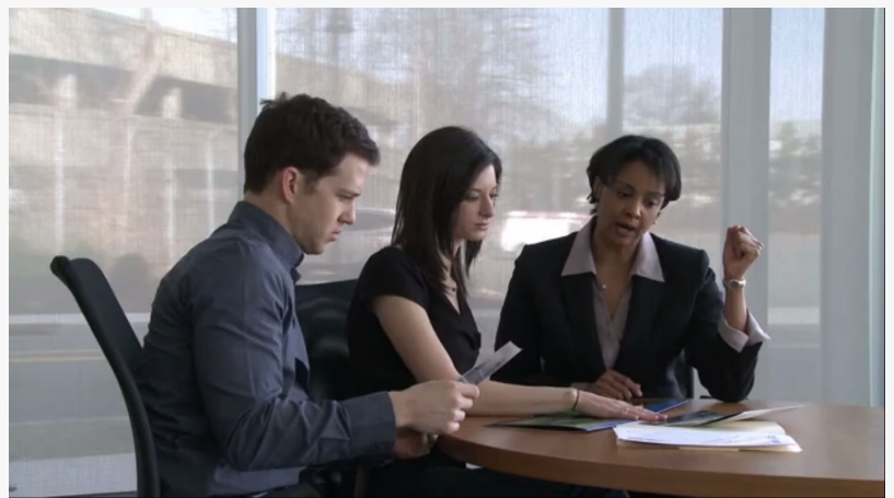
Group health insurance Dallas