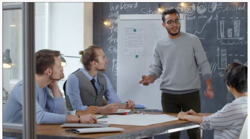
Life Insurance Dallas