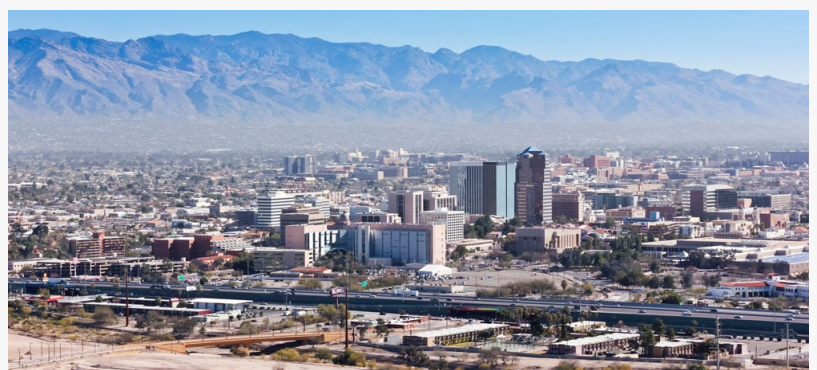
Tucson SEO by Salterra Image

Established in 2013, Salterra SEO Company in Tucson has continuously evolved to meet the ever-changing needs of the digital landscape. The company prides itself on adapting to trends, ensuring its clients stay ahead of the curve and maintain a competitive edge in their respective industries.