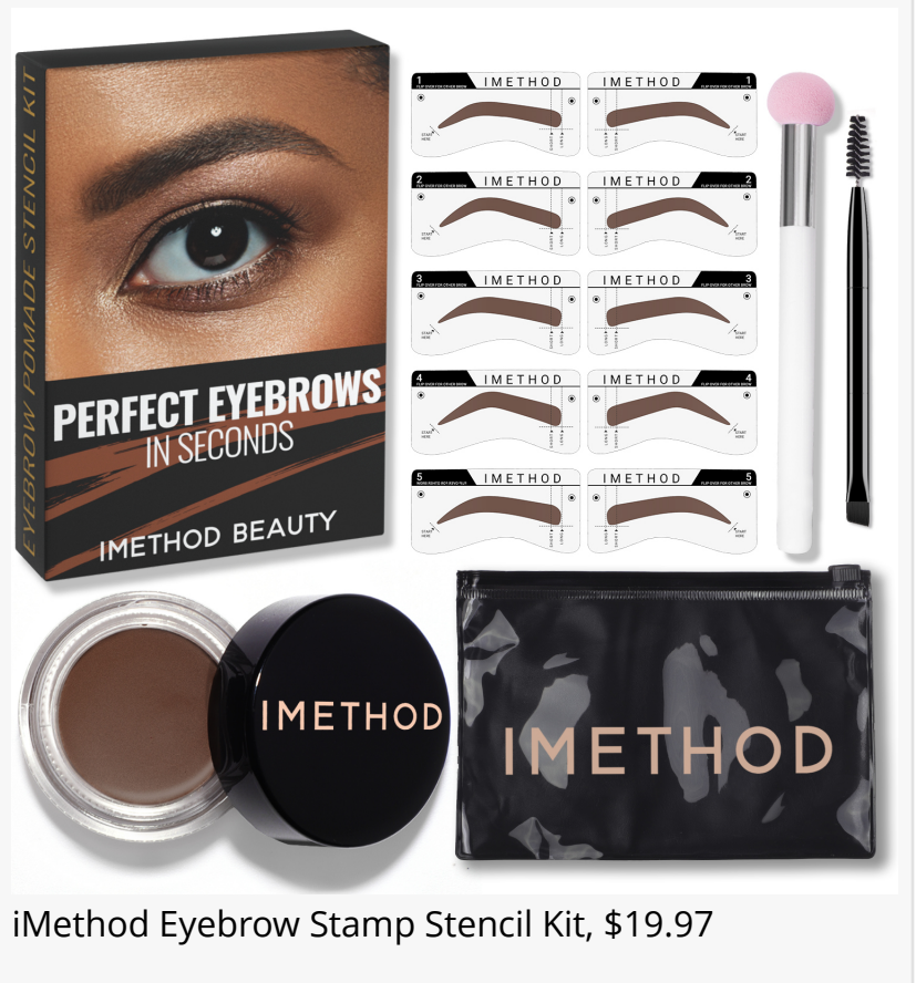
iMethod Eyebrow Stamp Stencil Kit, $19.97