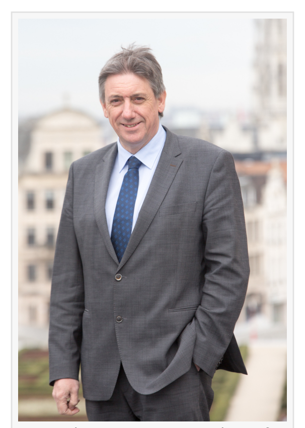
Jan Jambon, Minister-President of the Government of Flanders

Traders are likely to be able to validate an initial version of Gateway<sup>2</sup>Britain by the end of this year. The application will allow traders to fill out just one dataset online, which is then automatically shared with all the relevant supply chain & logistics partners.