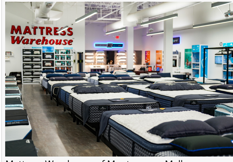
Mattress Warehouse of Montgomery Mall