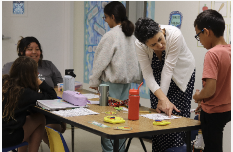
Check out our elementary school classroom!

Situated in the heart of West Hills, STARS Academy offers a comprehensive and rigorous academic program enriched with a distinctive musical theater emphasis. The school's curriculum is meticulously designed based on research-backed pedagogical approaches, placing a strong