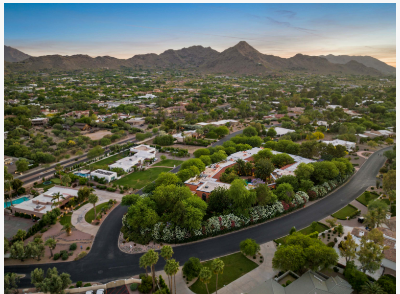
Casa Oso Negro | Paradise Valley, Arizona