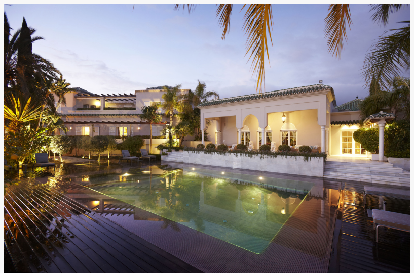
Prime Golden Mile | Marbella, Spain

Vollebak Island | Nova Scotia, Canada Bidding Opens 8 June