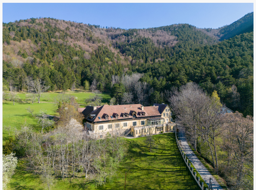
Luxury Sporting Estate | Near Vienna, Austria

Fifteen properties representing some of the finest luxury real estate in the world include Spain's historic Granja de Mirabel, with its stunning mansion, chapels, and lush gardens, offering privacy, Gothic and Moorish design, and a rich history; discover Vollebak Island and seize the exclusive rights to Ingels' extraordinary design vision; the ultimate 143-hectare luxury sporting estate in the Austrian Alps, featuring a magnificent main house, guesthouse, sporting lodges, and outdoor amenities; and the ultimate