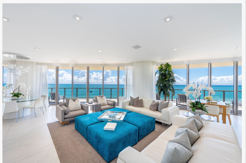
MIAMI, FL St. Regis Condo with 180-Degree Ocean Views | Miami, FL