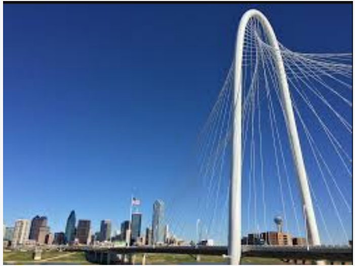
Life Insurance Companies in Dallas

Insurance4Dallas, (I4D), helps insure all of Texas, Oklahoma, Arkansas, Arizona, Louisiana, New Mexico, Alabama, Virginia and Florida. Insurance4Dallas provides consumers with detailed information on health insurance with the ability to purchase health insurance online. Insurance4Dallas provides a full spectrum of health, dental, vision, life and ancillary insurance products, providing a diverse selection of price and benefit options complemented by personal customer service. Available via phone, email or fax, Insurance4Dallas answers consumer questions throughout the purchasing process and during the utilization of its health insurance policies.