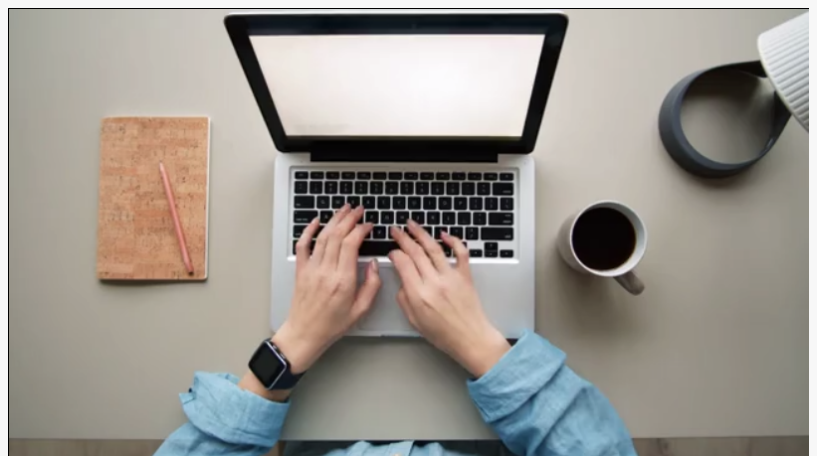
Group health insurance Dallas