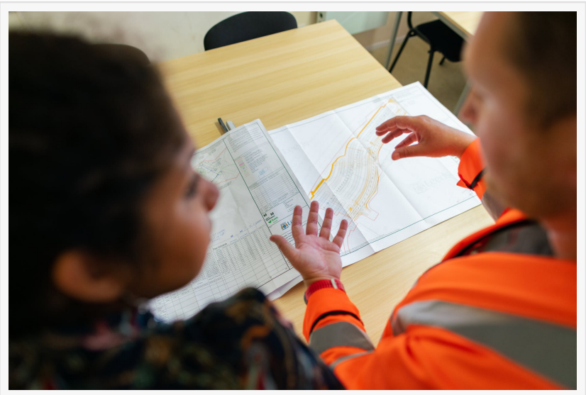
Small Business Bookkeeping Service

Small business owners have enough on their plates without having to worry about bookkeeping and financial management. Gulfstream Bookkeeping takes the burden of bookkeeping off the shoulders of small business owners, allowing them to focus on their core business activities. With