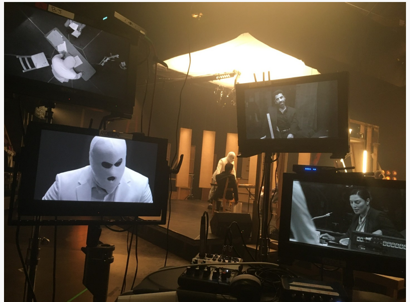
Scene2 from 'Yes Repeat No'

This press release can be viewed online at: https://www.einpresswire.com/article/637499401