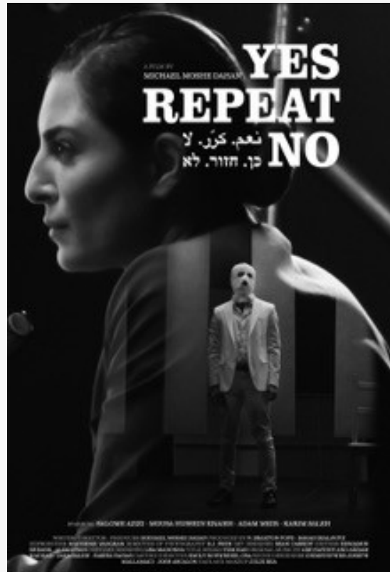
poster 'Yes Repeat No'