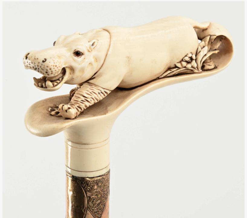
Handle of cane carved as glass-eyed hippo, from fine collection of canes featured in the auction. Estimate: $1,000-$3,000