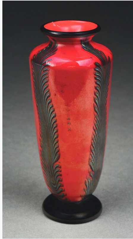
Signed Tiffany Studios Favrile feathered red glass vase, 6½in tall. Estimate: $10,000-$15,000