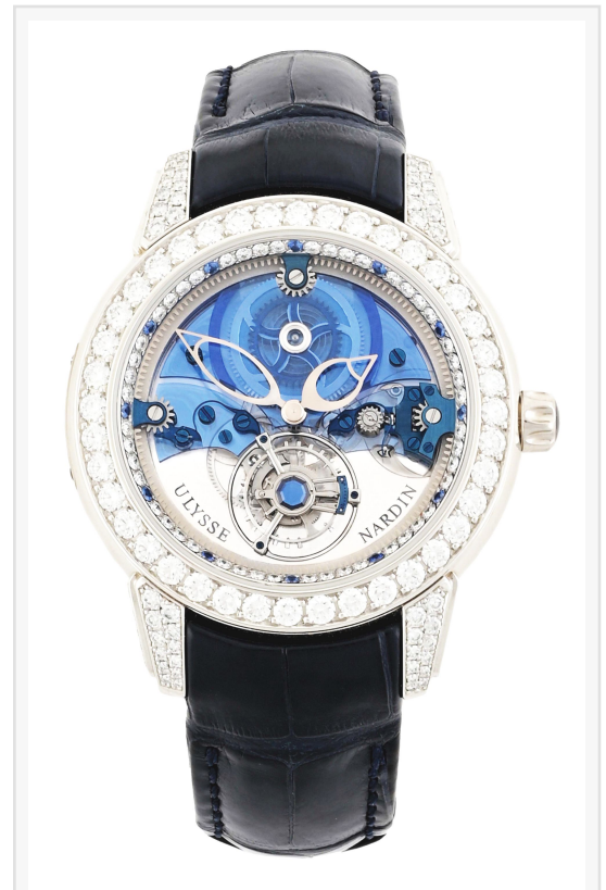
Exceptionally rare and important mint/boxed Ulysse Nardin platinum, diamond and sapphire Royal Blue Mystery Tourbillon watch, #1 of only 99. Estimate: $150,000-$250,000

Some may not realize that Tiffany Studios also produced beautiful art pottery. Such pieces are rare and sought after but don't appear on the open market very often. Morphy's is pleased to offer in its June 8 session a Tiffany Studios Favrile glass vase that boasts a striking red background with subtle flecks of gold and hand-decorated "feather"