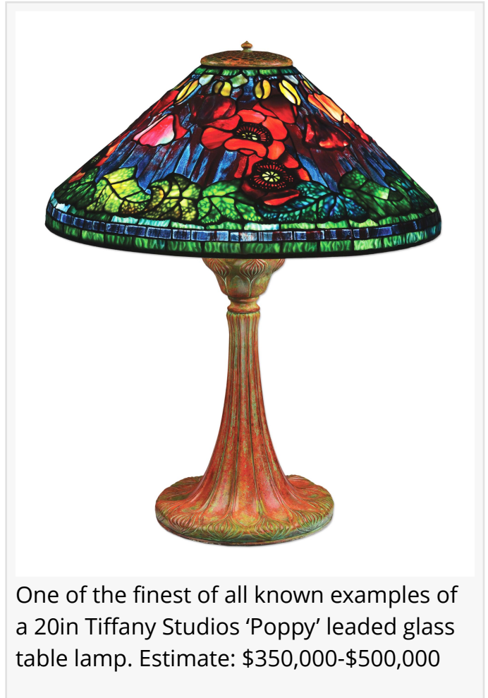
One of the finest of all known examples of a 20in Tiffany Studios 'Poppy' leaded glass table lamp. Estimate: $350,000-$500,000

An undeniable "statement piece" in the jewelry category is a ladies' 18K custom-made white gold engagement ring featuring a natural 7.77-carat Asscher-cut diamond, graded G color, VS2 clarity