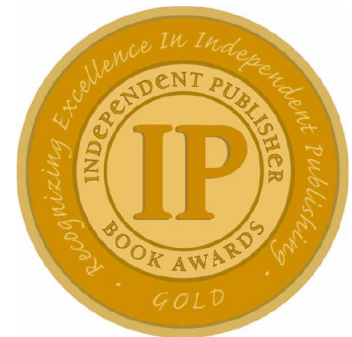
L. Ron Hubbard Presents Writers of the Future Volume 38 Gold Award Winner Science Fiction

Independent Publisher Book Award, IPPY, issued their Gold Award in the Science Fiction category to "L. Ron Hubbard Presents Writers of the Future Volume 38."