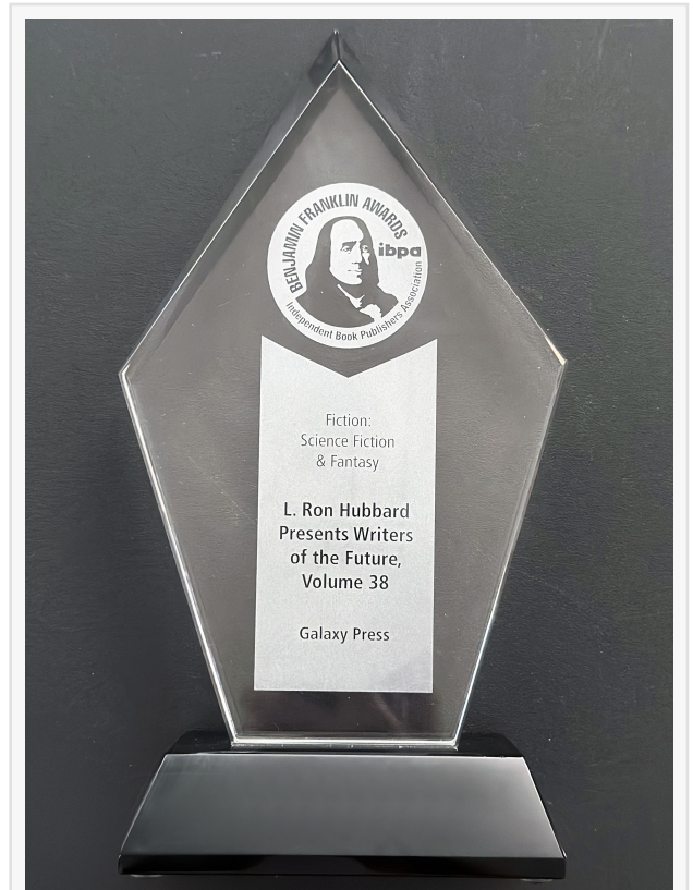
L. Ron Hubbard Presents Writers of the Future Volume 38 Benjamin Franklin Gold Award for Fiction: Science Fiction and Fantasy

L. Ron Hubbard initiated the Writers of the Future writing contest to provide “a means for new and budding writers to have a chance for their creative efforts to be seen and acknowledged.”