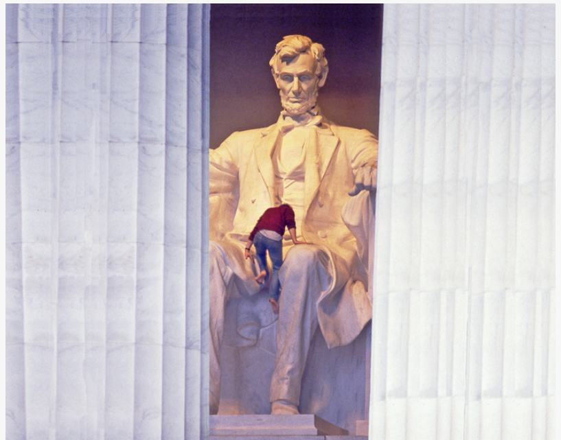
A typical photo from the book: "Monumental Mischief" a kid climbing on Lincoln!