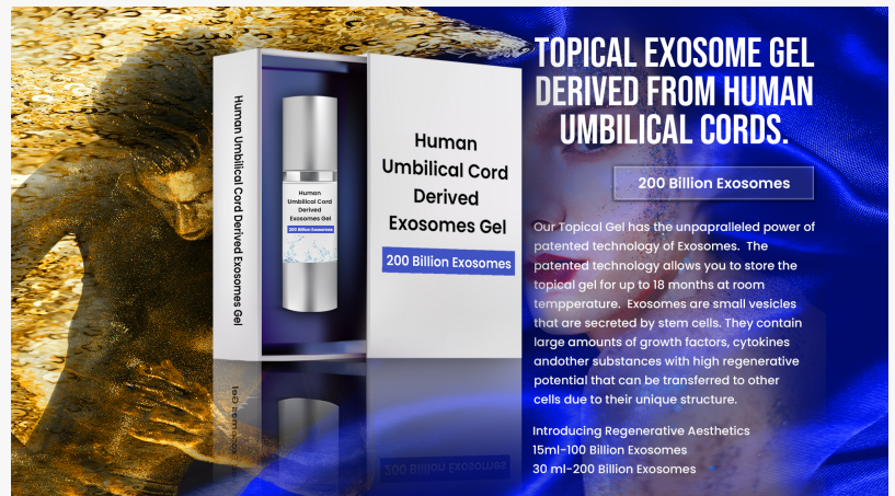
Hydra Gel of Exosomes