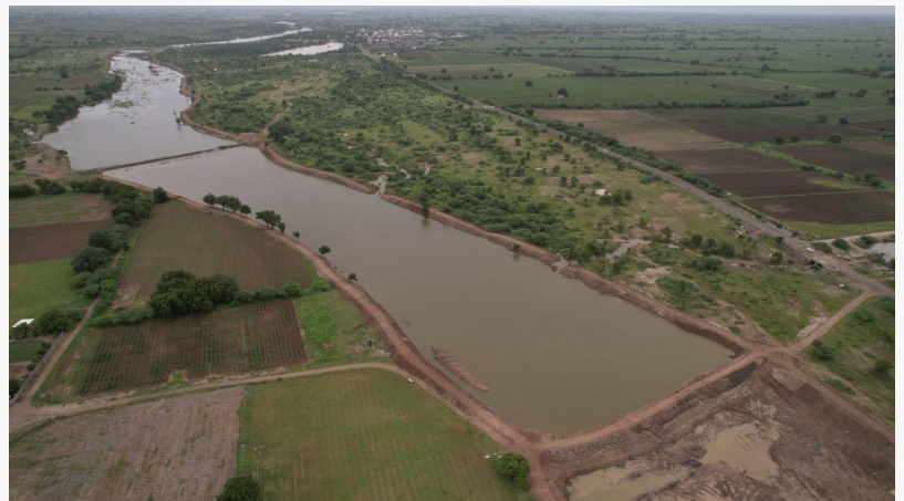
Hari Krishna Group dedicated a lake in the name of Watches & Jewellery Initiatives 2030