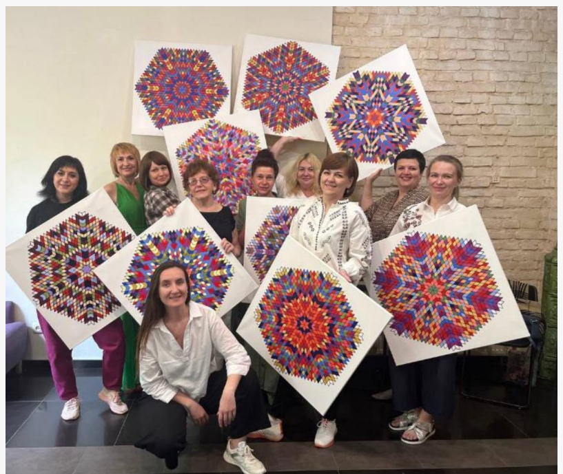
Psychological Support and Rehabilitation of Cancer Patients in Ukraine - "WE DO IT" Participants