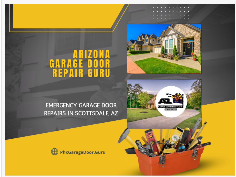
Emergency Garage Door Repairs in Scottsdale

feature also enables the company to monitor its technicians' progress in real-time, which can help improve the company's overall response times.