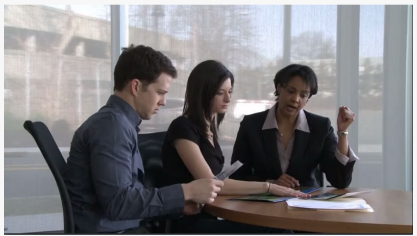
Group health Insurance Lewisville

This press release can be viewed online at: https://www.einpresswire.com/article/637755873