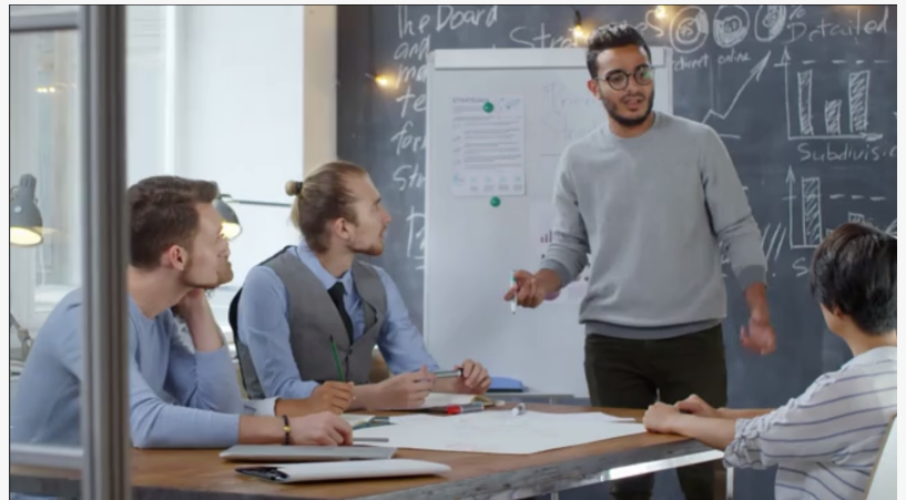
Life Insurance Agents in Lewisville