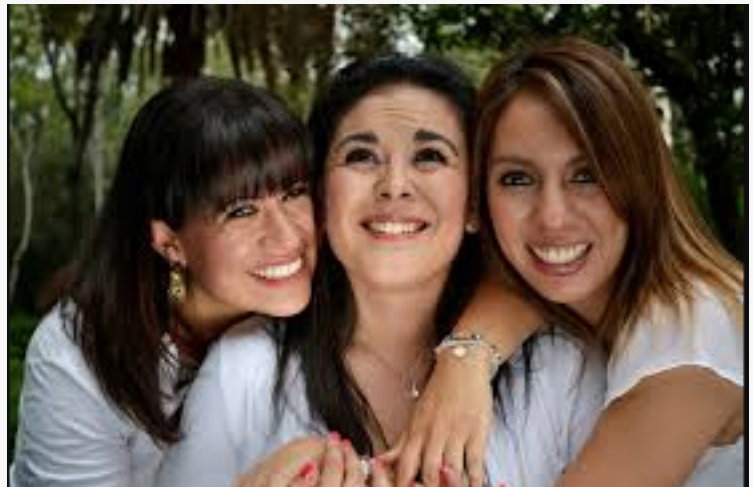
Health Insurance Lewisville