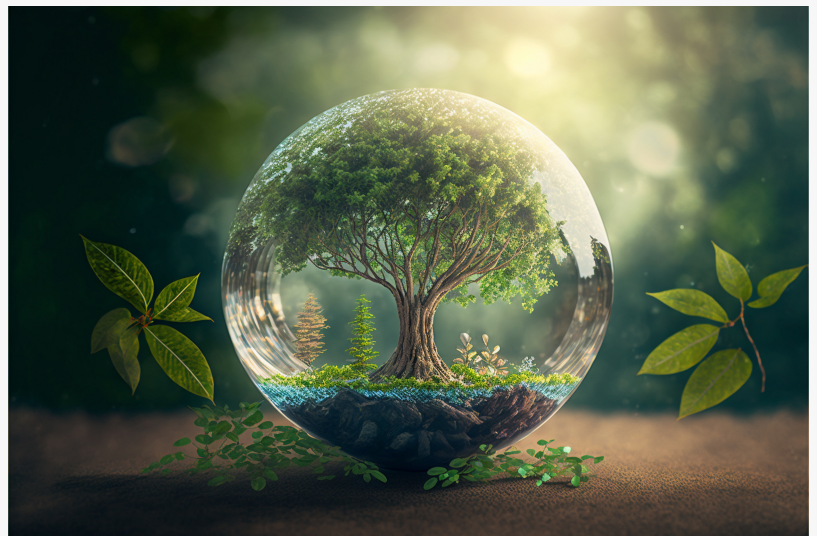
MyLand Earth Metaverse Supports a Green Earth with Plans for Massive Planting Trees