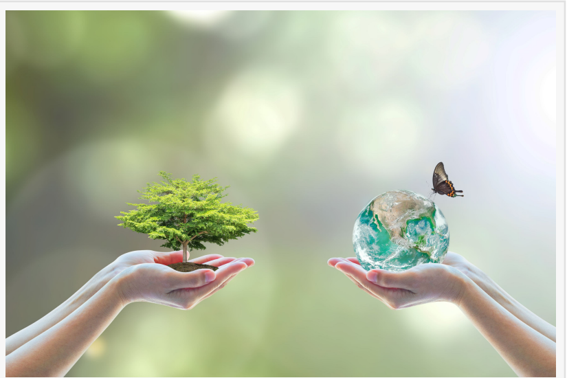
MyLand Earth Metaverse Encourage Environmental Protection with Planting Trees

MyLand.Earth Platform’s MMVR token will present NFT and Metaverse enthusiasts with a unique opportunity to participate in a presale for the IEO token offer (Initial Exchange Offer), starting on June 28, 2023, the anniversary day of MyLand.Earth Metaverse Platform Launch. The Metaverse