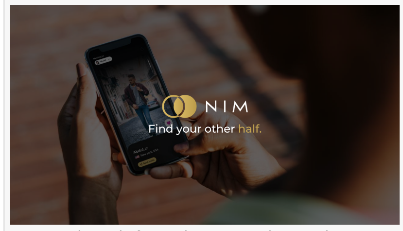
NIM - Exclusively for Ambitious Muslim Singles.

NIM empowers its members to leverage its proprietary "Circle" feature, inviting both single and non-single friends and family to play matchmaker.