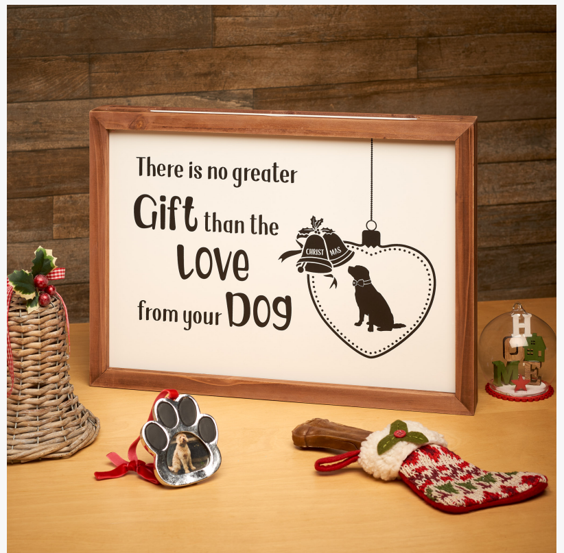
Seasonal Dog Life Interchangeable Wall Sign Collection

This press release can be viewed online at: https://www.einpresswire.com/article/637921069