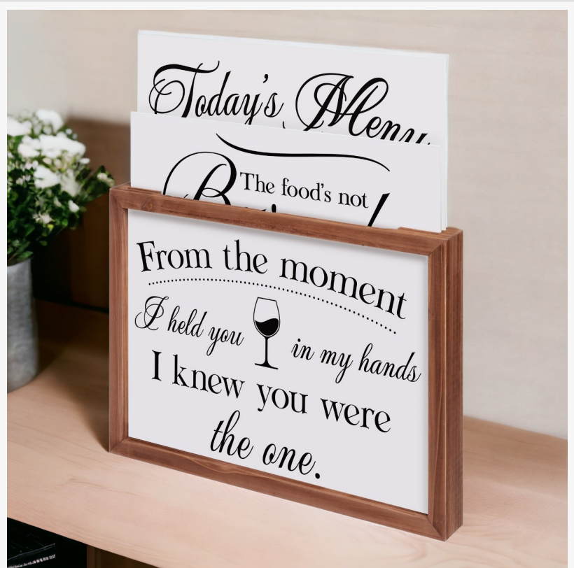
Kitchen Fun Interchangeable Wall Sign Collection

The product is highly versatile which means a user can interchange multiple collections with each other within the home.