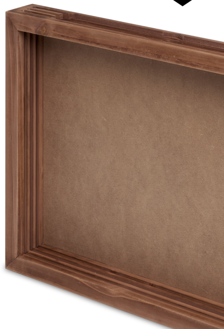
Vertoform™ Technology Interchangeable Design