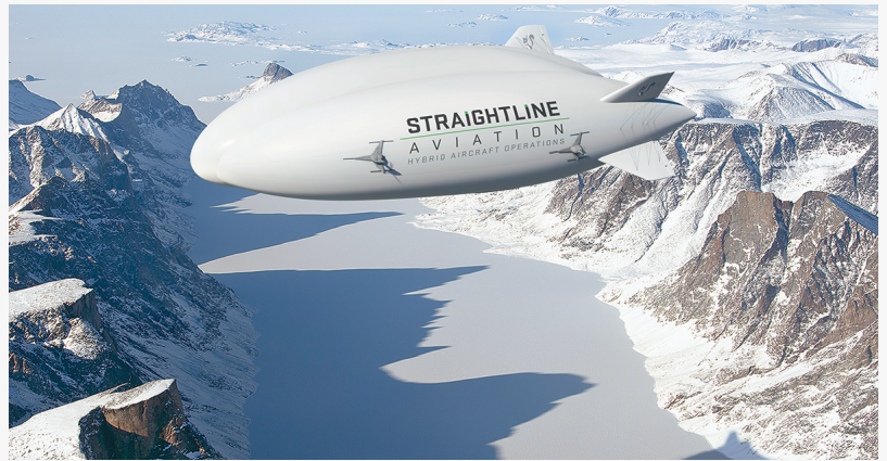
Straightline Aviation hybrid airship

Following the recently announced transitioning of the hybrid airship intellectual property and related assets from Lockheed Martin to AT2 Aerospace, Inc. (AT2), Straightline Aviation will act as lead customer of the AT2 hybrid airship and take delivery of the first aircraft in 2026. AT2, which is comprised of a team of hybrid airship engineers who led the project at Lockheed Martin's Skunkworks, has also agreed to work with Straightline in delivering its Round the World (RTW) non-stop un-refuelled net zero emissions flight, details of which will be announced later this year. Straightline's management team is regarded as the most knowledgeable go-to airship operator, having commissioned and operated a fleet of 19 airships and 200 aerostats in more than 35 countries.