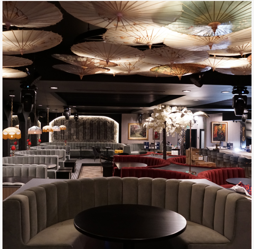
Discover Los Angeles' newest culinary gem, ADKT LA, A stunning restaurant where modern elegance meets natural charm, offering a feast for the senses